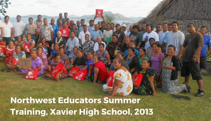
Northwest Educators Summer Training, Xavier High School, 2013